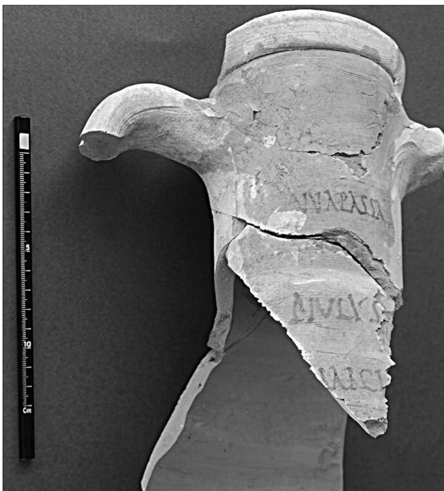
Fig. 2. Amphora with a dipinto stating the contents as raisins.

Ryc. 1. Novae. Odcinek 12, widok z południa.