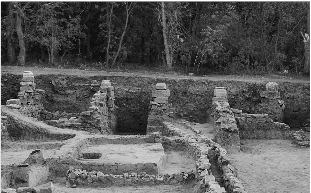
Fig. 6. Late antique portico.