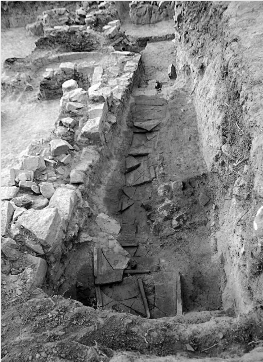
Fig. 4. Channel laid out with tiles.