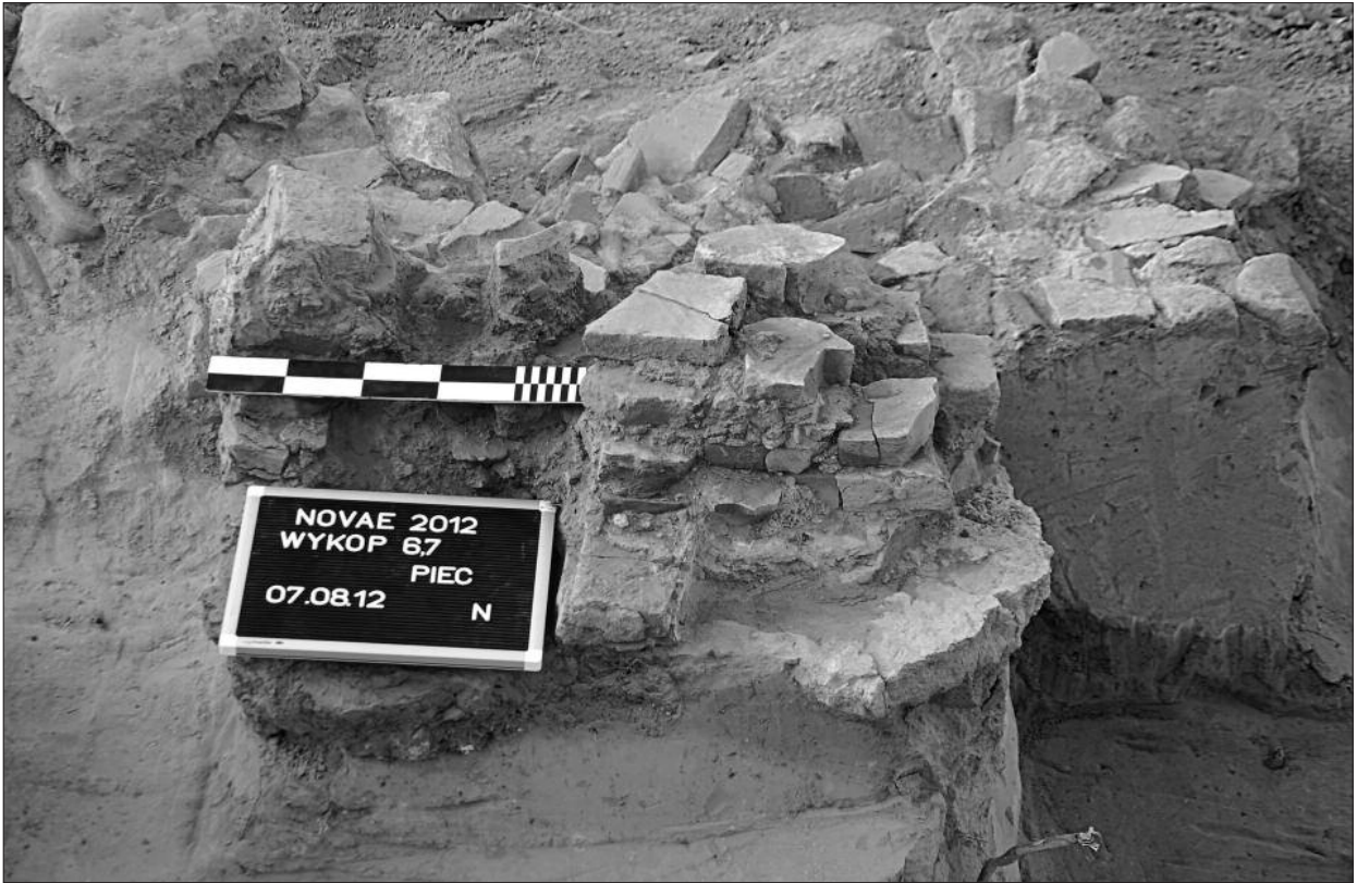
Fig. 5. Late antique glass kiln.