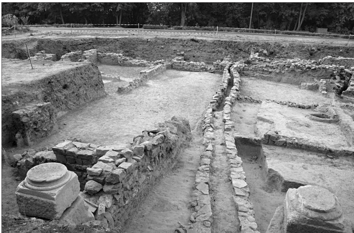
Fig. 1. Novae. Sector 12, view from the south.

Ryc. 1. Novae. Odcinek 12, widok z południa.