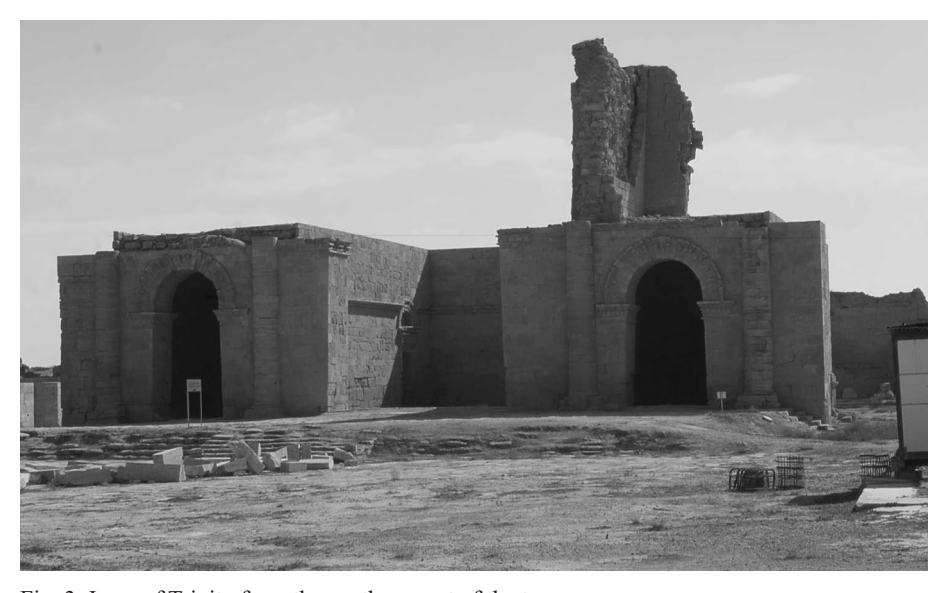
Fig. 3: Iwan of Trinity from the southern part of the temenos. (K. Jakubiak) \,