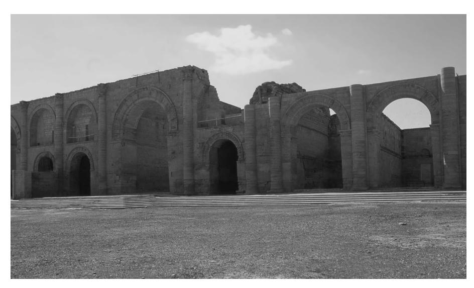
Fig. 4: Great Iwans. (K. Jakubiak)