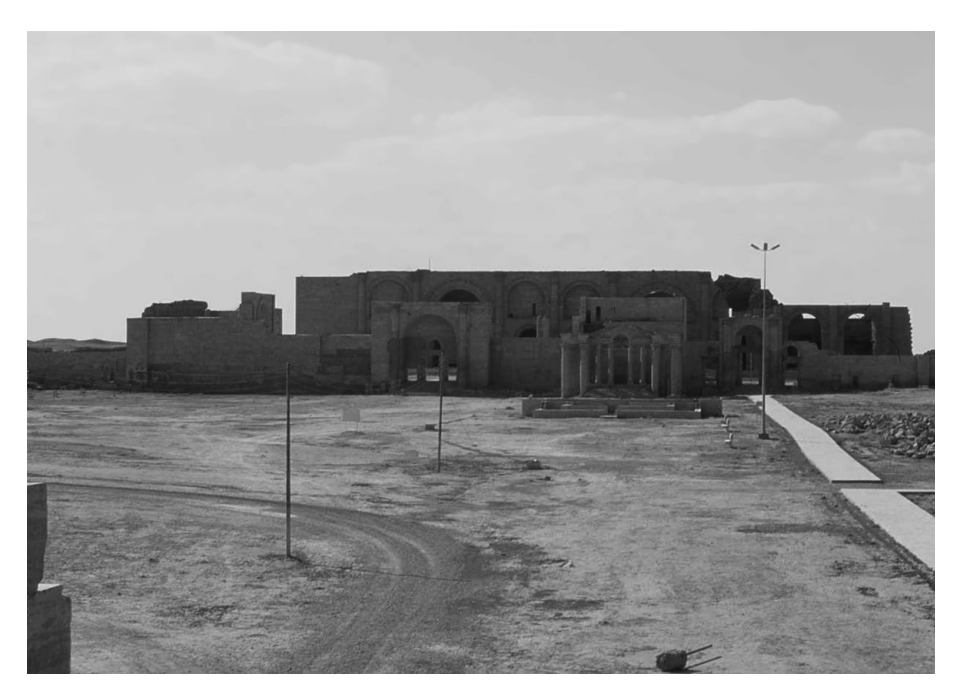
\label{eq:Fig. 5: Main Sanctuary - view from the east.} \\ (K. \ Jakubiak)