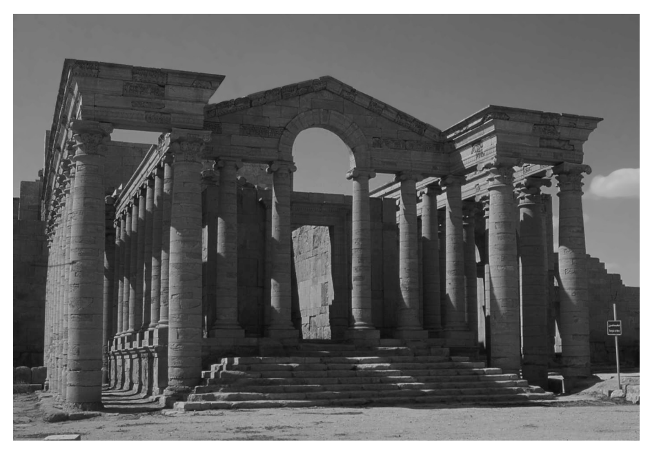
Fig. 2: Temple E in the eastern part of the temenos. (K. Jakubiak) \,