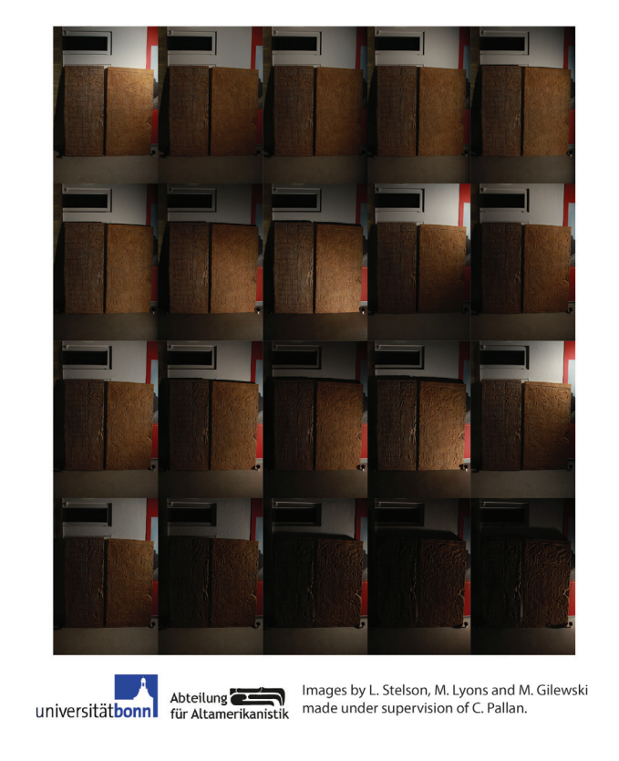
Figure 2. 20 (of 68 total) digital images (with various light direction) taken to produce the RTI image shown in Figure 1.