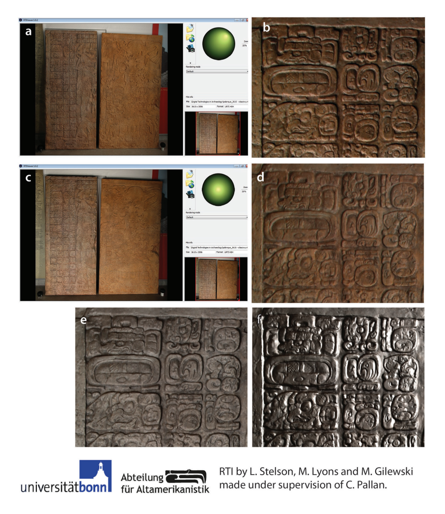
Figure 1. Selected imagery from an RTI image of a cast of a Maya stela. Screenshots from RTI viewer software (a, c); enlargements showing fragments of the inscription in different lighting (b, d); and with the specular enhancement (e, f).

less than forty minutes (Figure 2). During the workshop, I witnessed first-hand that this technique uses few resources and money: the most basic DSLR cameras, heavy old tripods, cheap remote triggers and improvised shiny black spheres that some students brought to the workshop worked just fine (compare Goskar and Earl 2010).